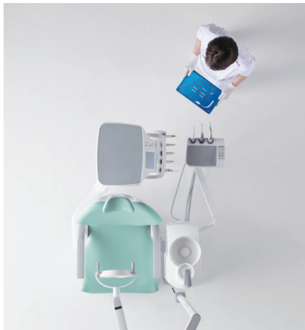
Positioning the doctor table behind the chair enables assistants to prepare during consultations without distracting the dentist or the patient.

The combination of the base-mount unit and the folding legrest chair gives dentists and assistants a more comfortable and ergonomically efficient operating space. Positioning the doctor table and the assistant holder tray behind the chair also eases patient anxiety, as they are not exposed to the dental instruments during their treatment. Meanwhile, the rotating function of the spittoon bowl ensures convenient access for every patient, including the elderly, as they rinse and gargle during and following their dental procedure. This positioning also allows for easy cleaning and maintenance of the unit.