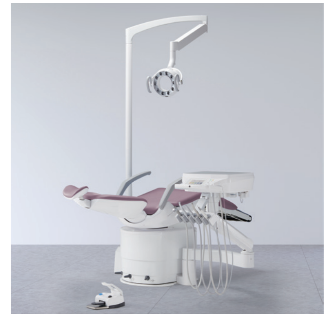
S6 Without Cuspidor