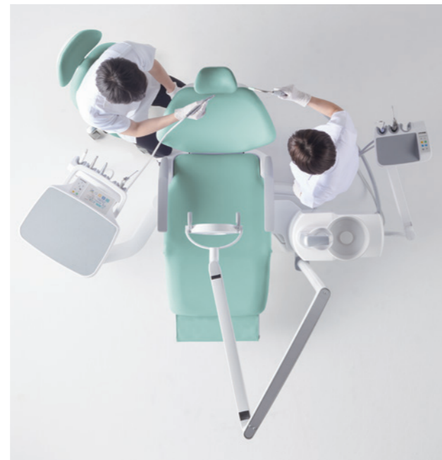
The cuspidor rotates 90° outwards, making it possible for assistants to stand at the 3 or 4 o'clock position. This allows for convenient access to support the dentist during a wide range of treatments.