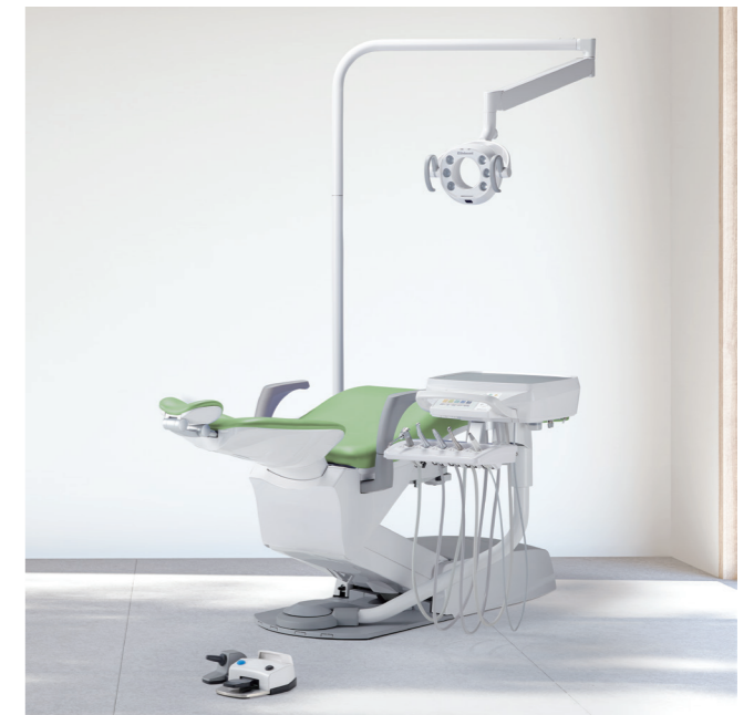
S8 Without Cuspidor